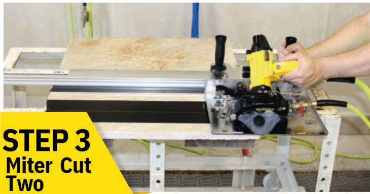
STEP 3 Miter Cut Two