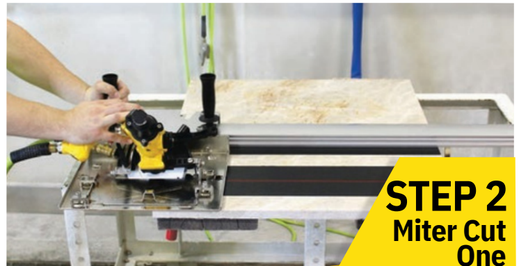
STEP 2 Miter Cut One